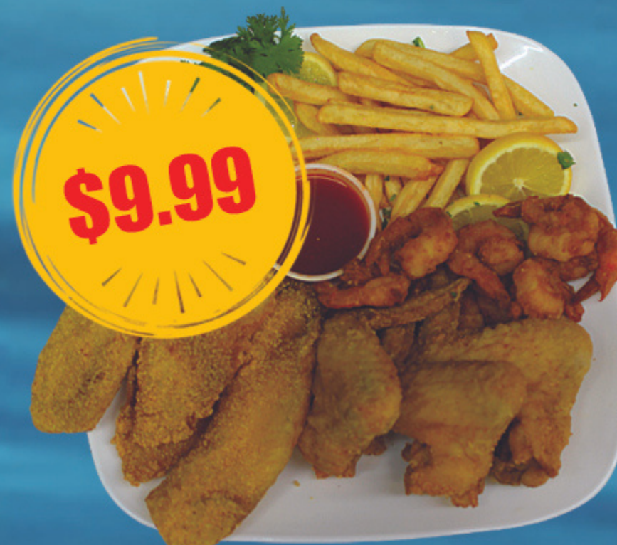
1 PC TILAPIA 2 WINGS & 5PC SHRIMP