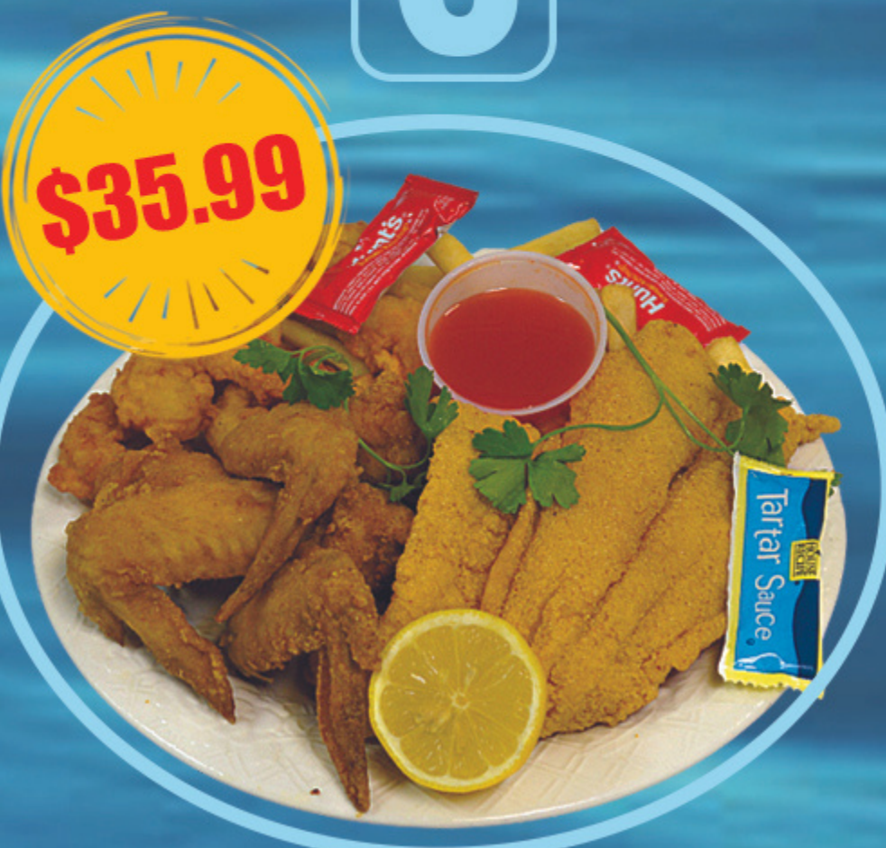
4PC FISH (TILAPIA OR CATFISH) 15PC SHRIMP & 10 WINGS