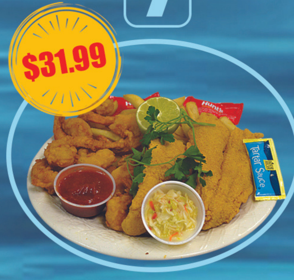
20 SHRIMP + 5PC TILAPIA OR CATFISH & FRIES