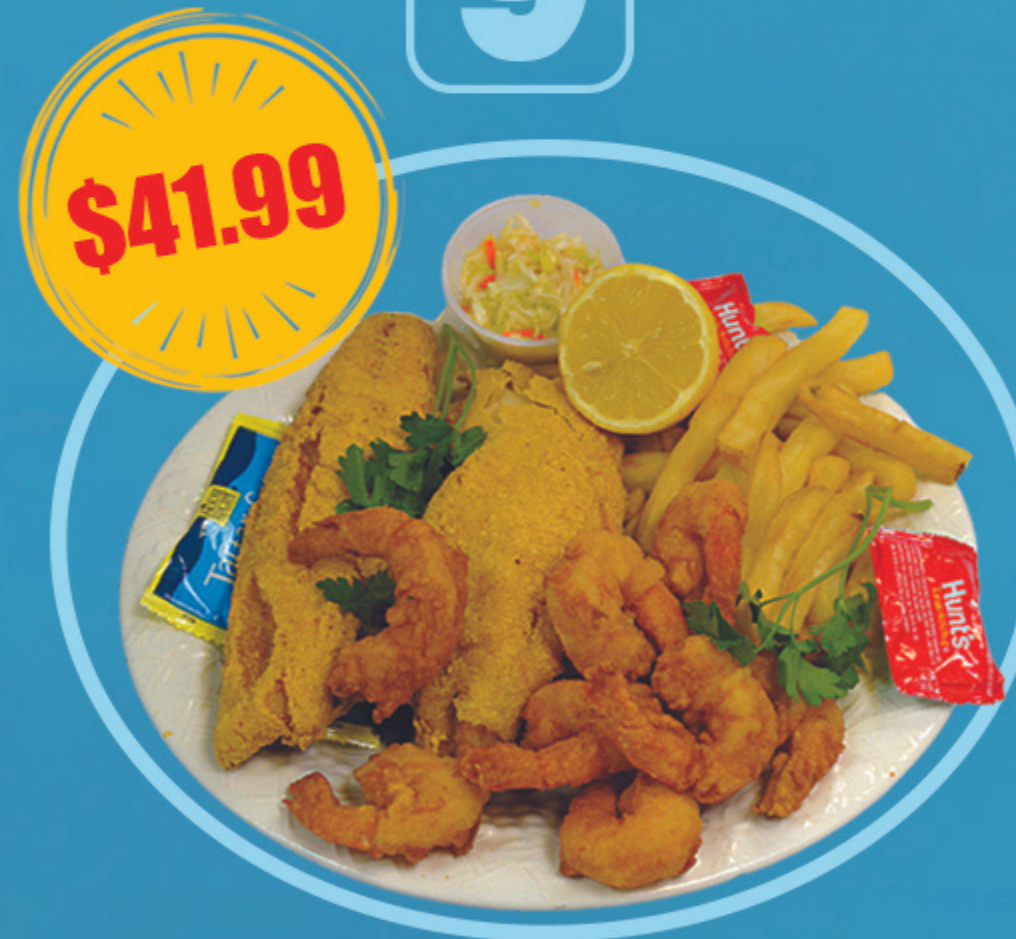
4PC GROUPE OR SNAPPER 10 WINGS + 15 SHRIMPS