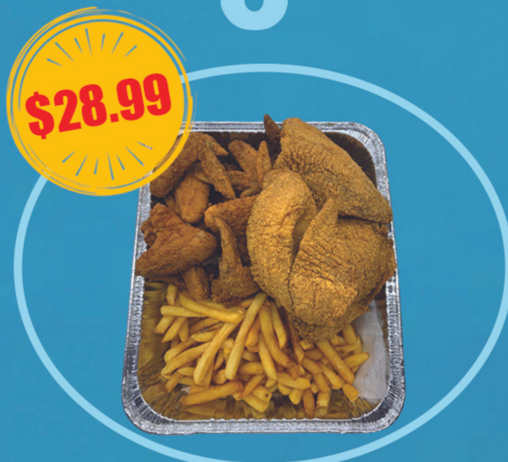
5PC TILAPIA OR CATFI WITH 10 WINGS & FRIES