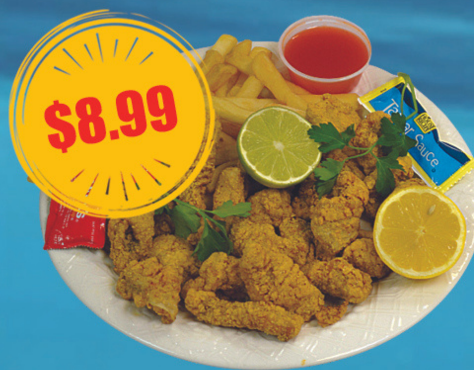
CATFISH NUGGETS & 5PC SHRIMP