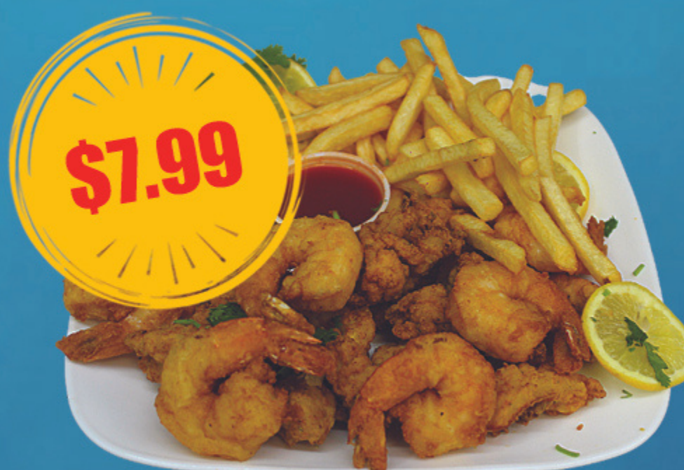
2 WINGS & 5PC SHRIMP